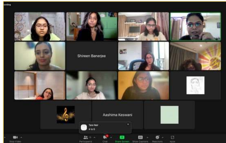
Picture 20 Screenshot of the YLAC session

Sama team members on invitation facilitated a session on understanding reproductive health rights issues for a group of young women fellows with YLAC (Young Leaders for Active Citizenship). An online session and interaction were held on July 16th 2023. Following a presentation by the Sama team member, the participants led an enriching discussion by sharing their doubts and experiences which led to an exchange of perspectives and strengthened understanding of the issues of reproductive health rights in linkages with patriarchy, social norms and the role of policy landscape on this.