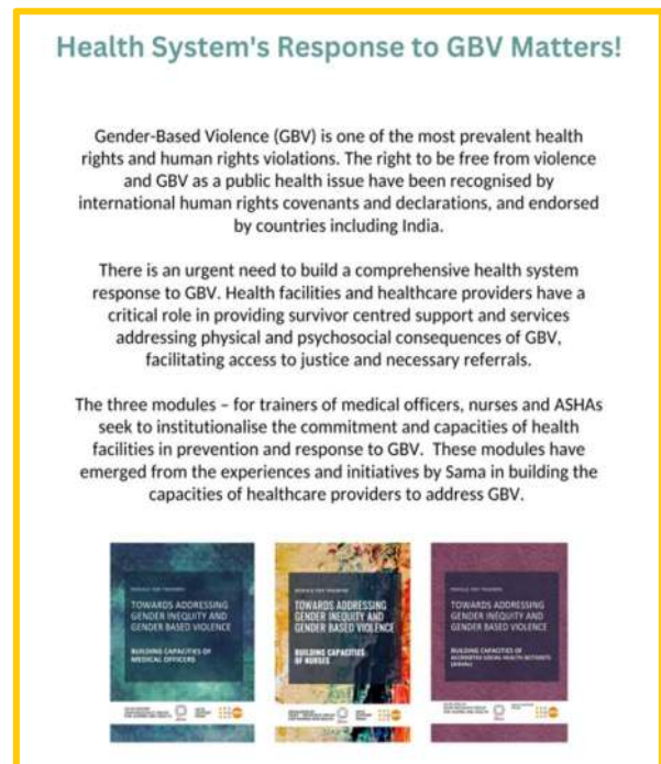
Picture 6 Dissemination flyer of Sama Modules

The three modules by Sama for trainers of medical officers, nurses, and ASHAs were finalised and completed by the team. A brief about these modules was also shared through social media and communication channels of Sama. Further final copies of these Modules are being uploaded for open-source access at the Sama website, and the strategic dissemination of these modules with state health departments, and other key officials at the national/state level is being currently explored.