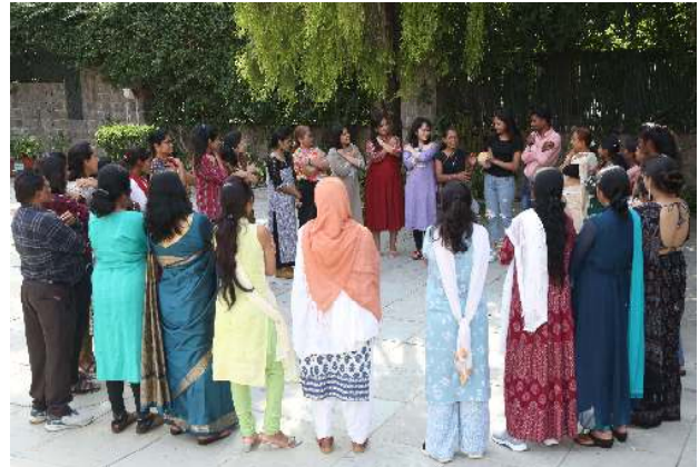
Picture 19 Pictures from the Roundtable: Activities and Panel Discussion

This Roundtable was an important step for bringing together the organizations and resource persons with requisite experience and sustained engagements on these issues and to collectively looking at the challenges, milestones and ongoing strategies for advancing the agencies, leadership and rights of young girls. CBO leaders and young persons from different states joined this consultation as we saw representation from Delhi, Jharkhand, Bihar, Uttar Pradesh and Chhattisgarh. A mix of panel discussions and art-based pedagogies by the resource persons from the Aagaaz Theatre Trust team guided the process of reflections and presentations during the roundtable.