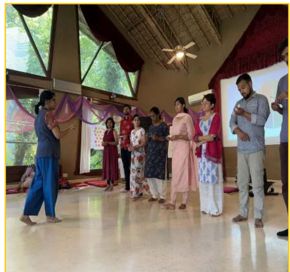
Picture 4 Short course pictures