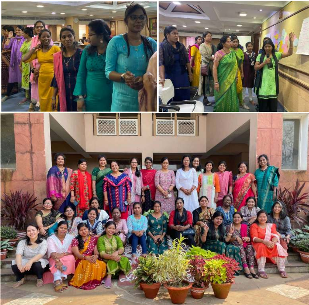
Picture 1 Participants from short course in Odisha