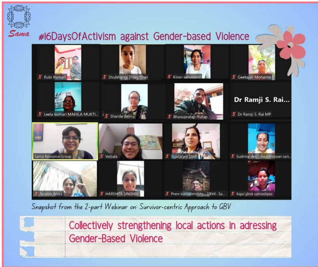
Picture 13 Snapshot from another webinar during 16 days of Activism