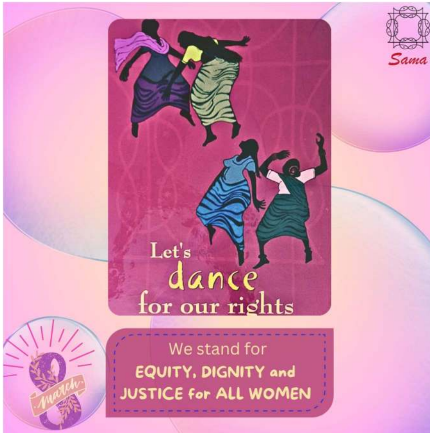
Picture 15 Sama poster for International Women's Day 2024

गर्भसमापन में महिला के ऊपर परिवार का दबाव, समाज का डर और अस्पताल में अपेक्षित सपोर्ट नहीं मिलता है। बदनामी का डर से गलत लोगों के पास, गलत डॉक्टर के पास गर्भसमापन के लिए पहुंचते परिणाम यह होता है कि असुरक्षित तरीके से गर्भ समापन से कभी कभी जान पर भी खतरा आ जाता है। गर्भसमापन को लेकर दिक्कत सभी के लिए है विवाहित हो या अविवाहित। क्योंकि उनके शरीर पर खुद की अनुमति नहीं होती है।