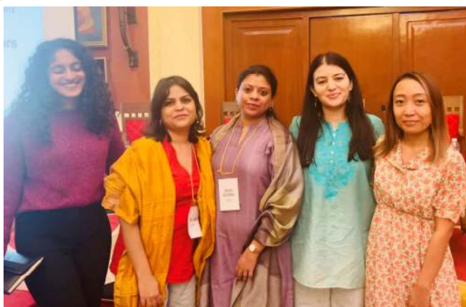
Picture 21 Photo of the moderated panel on Abortion rights

Sama team member was invited to moderate a panel on abortion rights as part of the "Reproductive and Sexual Autonomy in Asia" symposium held in Kathmandu, Nepal, on October 15–17. Sama's participation contributed to the discussion by different experts on reproductive health and rights on pressing and emerging issues in reproductive and sexual rights in Asia, with a focus on the impact of legal and policy frameworks.