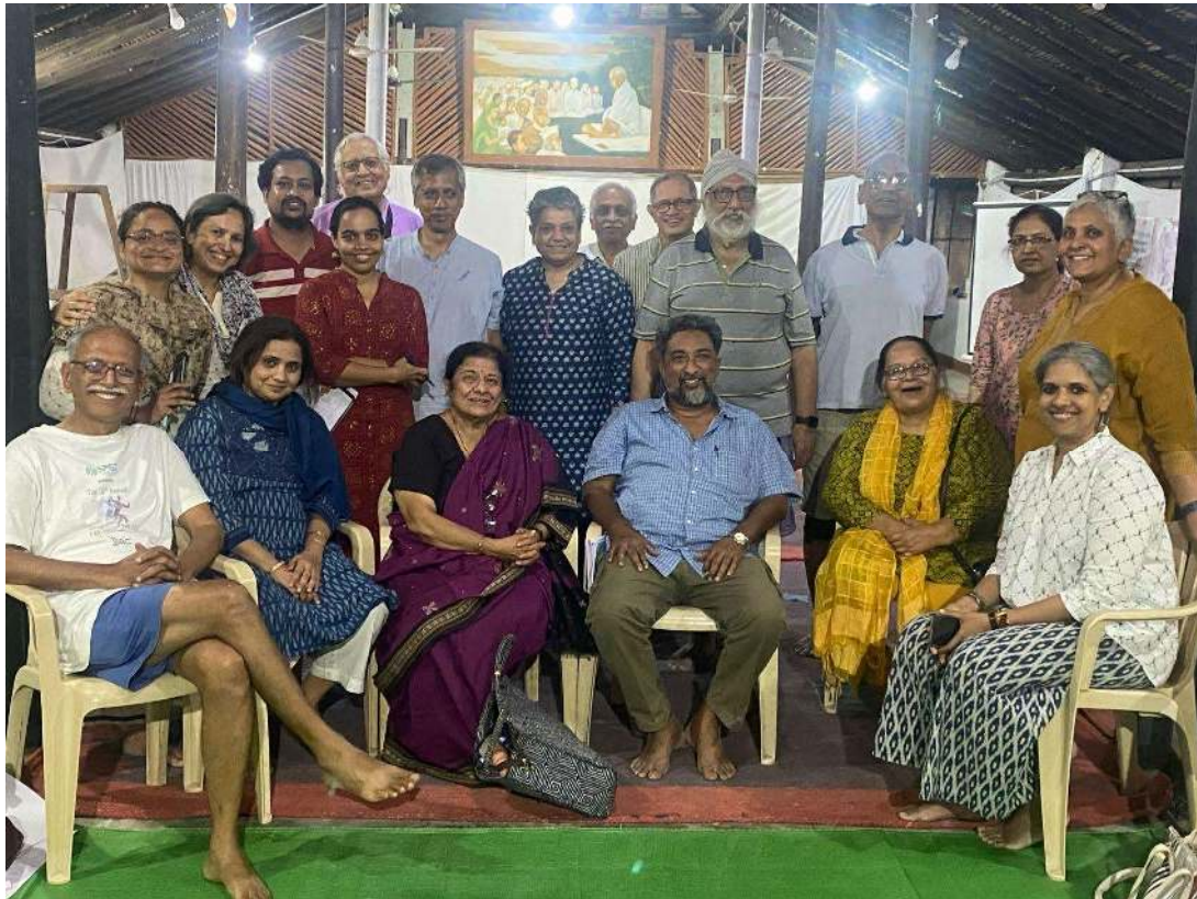
Picture 18 Pictures during MFC