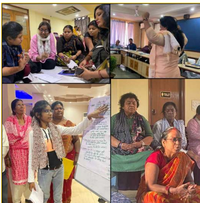
Picture 5 Workshop pictures

A blog on the Sama website captures this discussion.