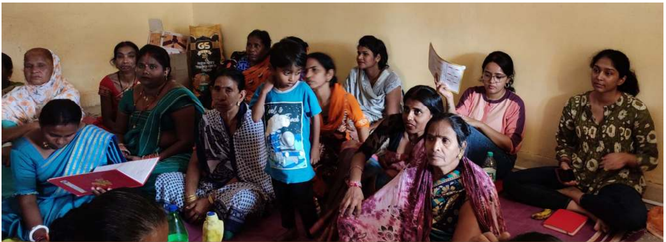
Picture 17 Pictures from field visit in Chhattisgarh

There is a conspicuous lack of studies or research on this domain in India. Our field-level work has presented us with urgent and complex questions and issues that need wider deliberation and Sama initiated interacting with people with SCD and documenting their experiences along with interacting with the health care providers in Chhattisgarh.