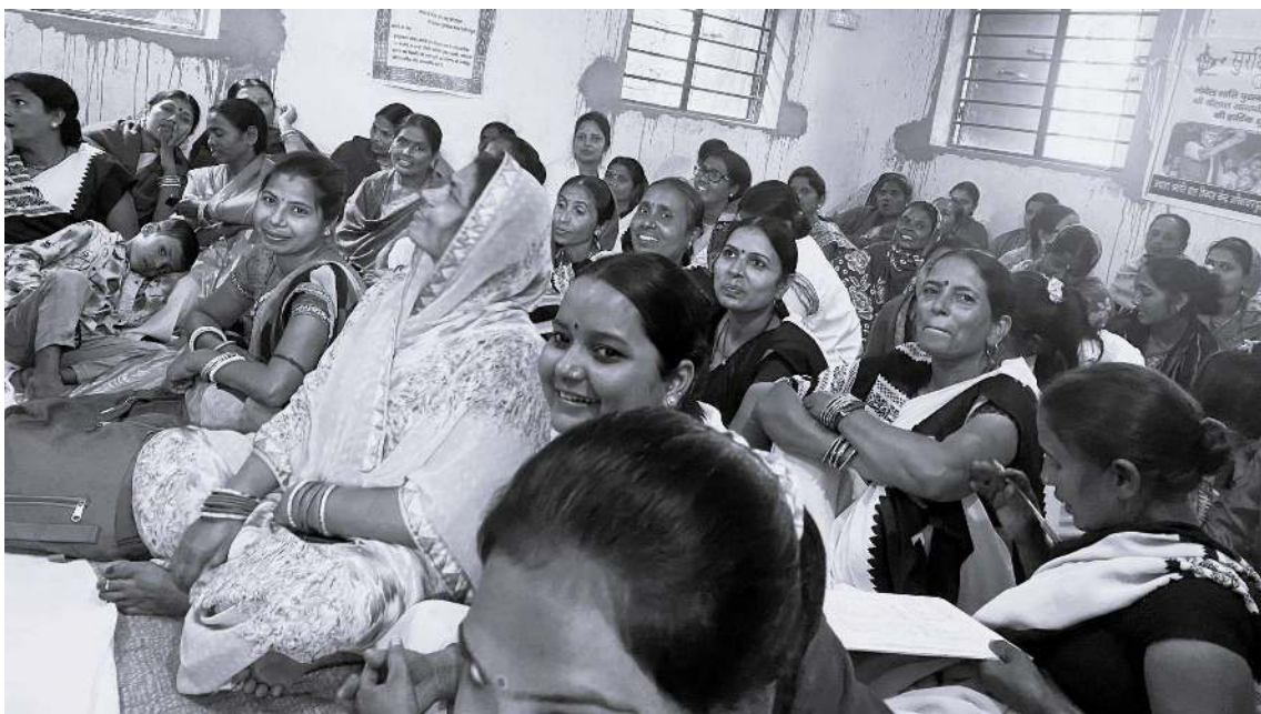
Picture 8 from community meetings in Samastipur, Bihar

In addition to this, Sama team members also participated in a National Meet on 'A decade since the enactment of laws on sexual violence, sexual harassment, and trafficking: stocktaking and exchange' organized on 23rd August 2023 and shared our experience and insights with a focus on sexual violence. Sama strengthened the discussions on incorporating a health-centered approach by strengthening local support networks for policy engagement and health system accountability for GBV survivors.