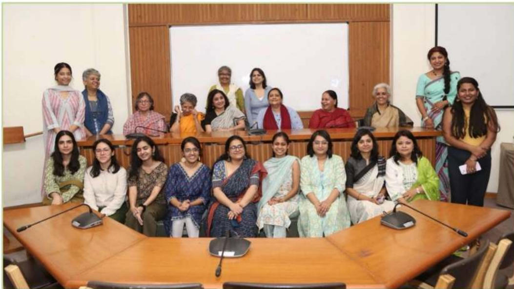
Picture 16 Group picture with participants, National Consultation on ART, Surrogacy

Sama's sustained work on surrogacy, assisted reproductive technologies (ARTs), and infertility from a reproductive justice approach has for many years garnered attention from multiple actors including young researchers, legal experts, policy experts etc. Sama's two decades of engagement with Assisted Reproductive Technologies (ARTs) and surrogacy through research, capacity building, policy advocacy, and knowledge resources is an important milestone.